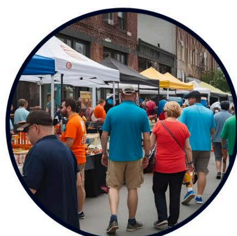
Community Resources, Food & Drink Vendors