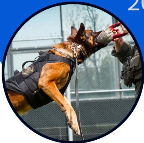
Specialized Units Demonstrations