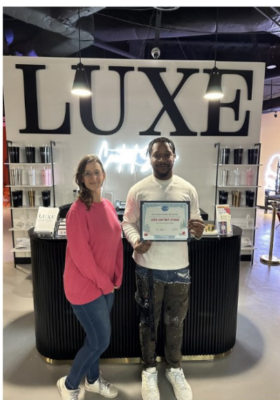
Best Christmas Spirit: Luxe Content Studio