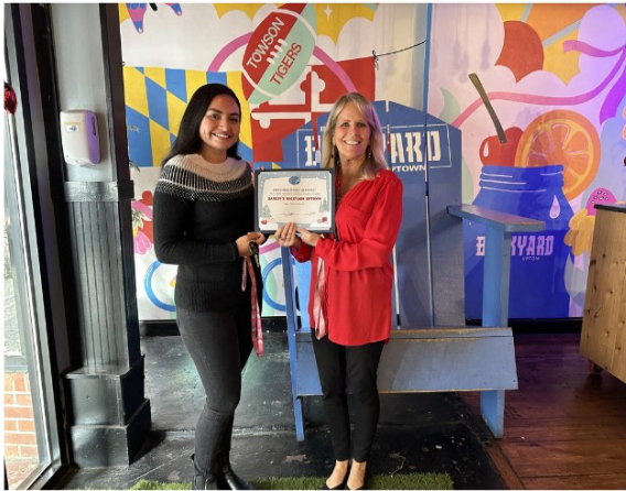
Most Festive: Barley's Backyard