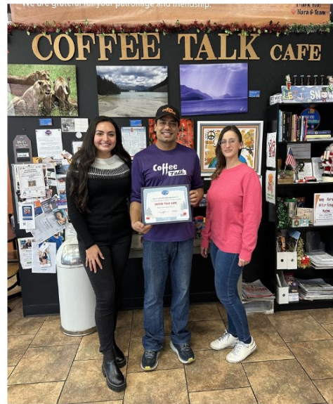
People's Choice Winner: Coffee Talk Cafe