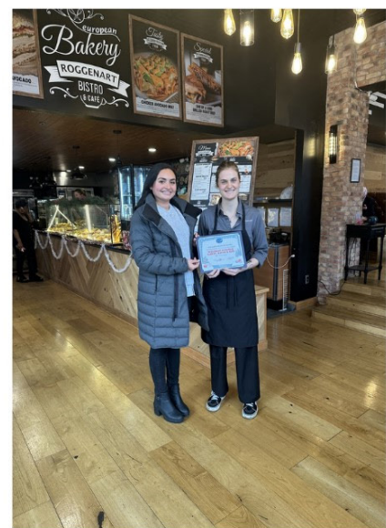
Most Artistic: Roggenart