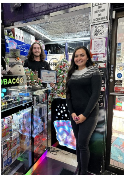
Most Creative: Zaza Cloud Smoke Shop