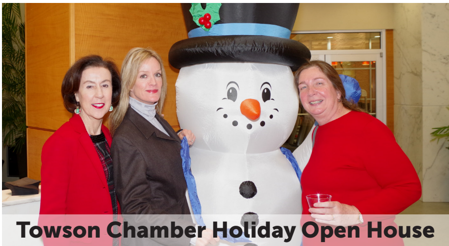
Towson Chamber Holiday Open House