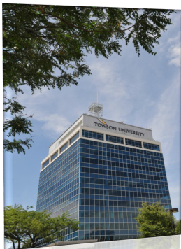
1 Olympic Place, Lobby Level Towson, MD 21204

We base our programs on the latest research to promote optimal health and well-being.