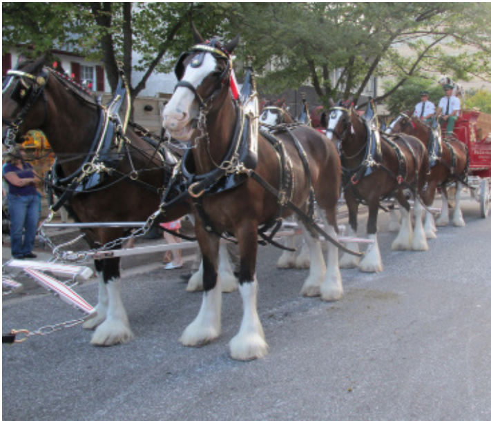
Your Budweiser Clydesdales. These large beautiful horses travel all over America to events like Feet on the Street. Thanks Anheuser Busch for giving Towson the opportunity to meet these beauties!