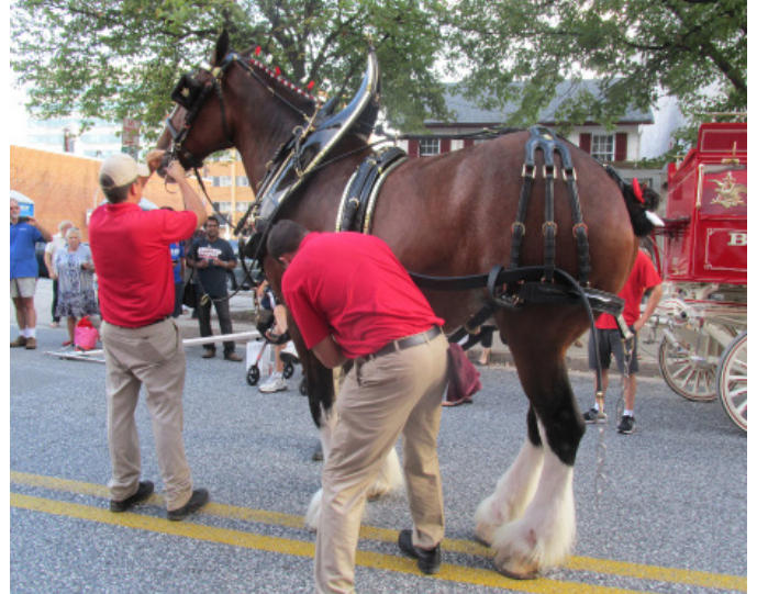
It's finally time to get the horses ready. Each horse is groomed and given a harness, bridle, headstall, rein, and other equipment.