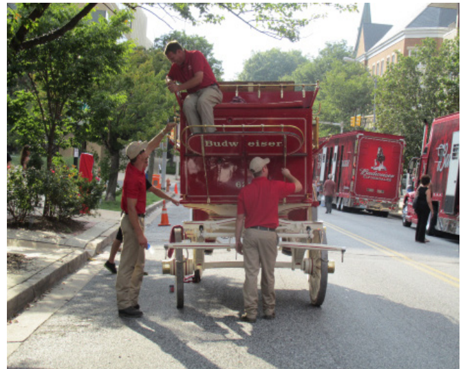
The Budweiser team first set up a horse buggy for the Clydesdales.