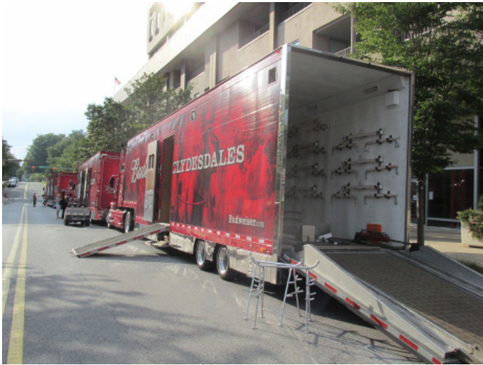
The Budweiser Clydesdales arrived in front of the Penthouse around 5pm in three large Budweiser trucks.