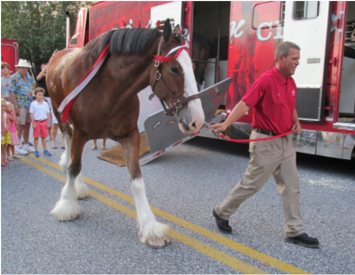
Many people crowd around the bus as the horses are taken off one-by-one.