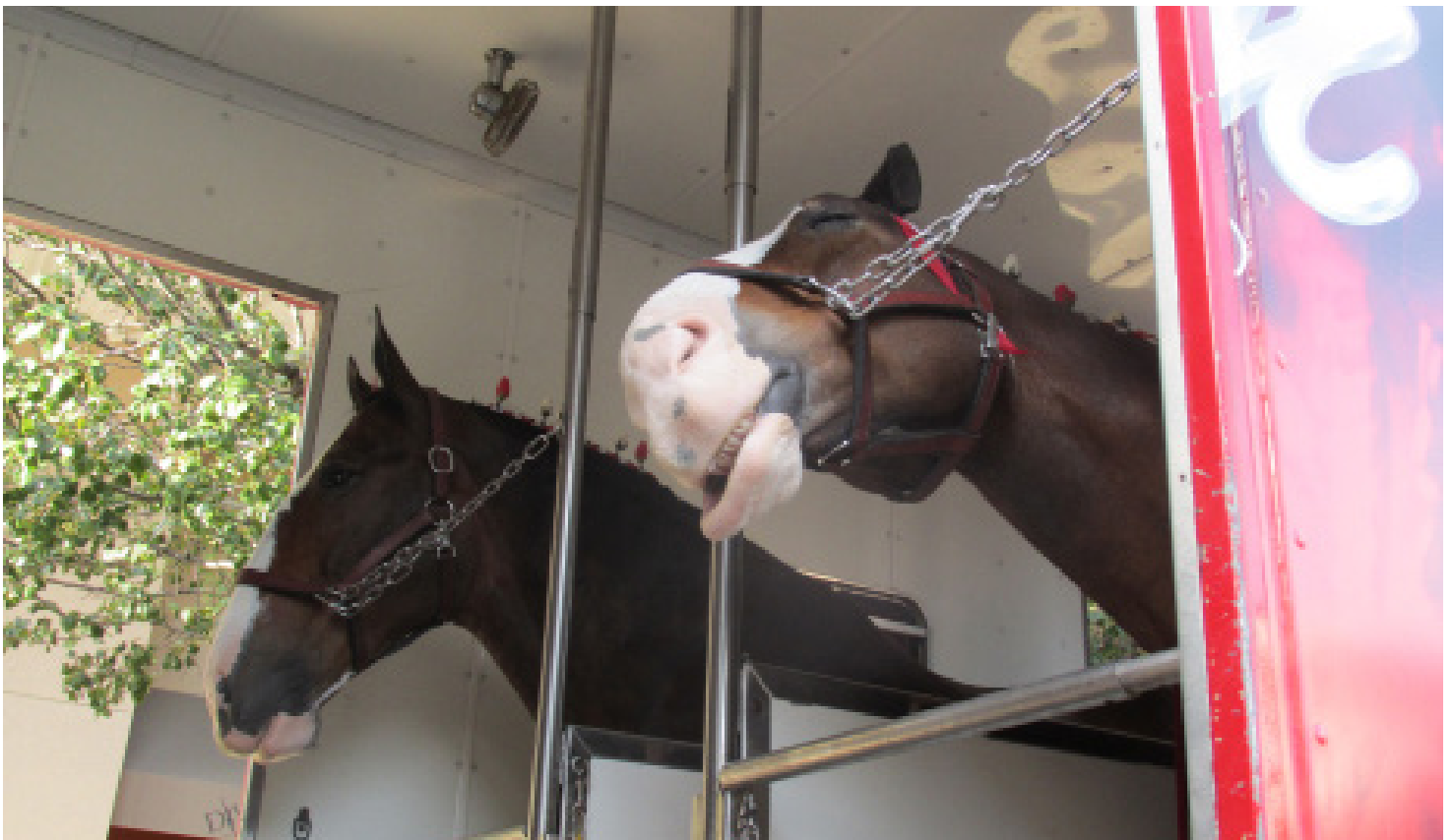
The Clydesdales patiently wait to be pampered for Feet on the Street. They are so excited and cannot stop smiling!