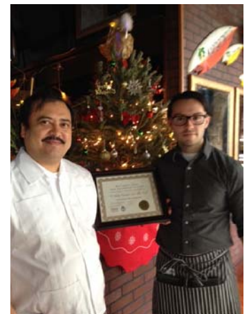
El Rodeo Cantina Most “Traditional”