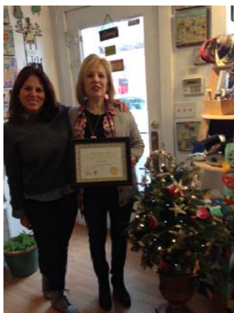
Bead Wear Most “Original”