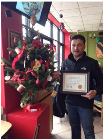
Towson Hot Bagels “Most Creative”

With a field of 36 and 4 categories—these candidates won top honors at our very first tree decorating contest. Hundreds were on hand to mark their ballots and enjoy the simply pleasures of the holiday. We applaud all those who took part in the competition and look forward to 2014!