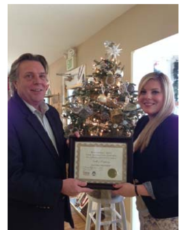
Grillo & Company Most “Festive”