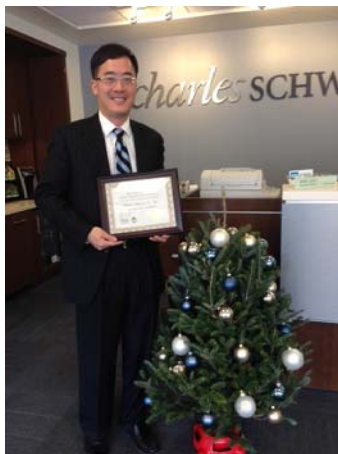
Charles Schwab & Co., Inc. Most “Traditional”