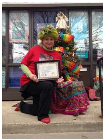
Anna Appicella School of Dance Most “Creative”