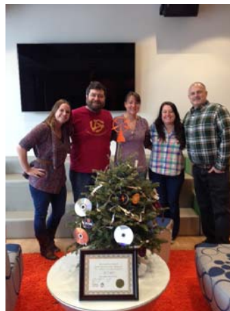
WTMD Most “Creative”