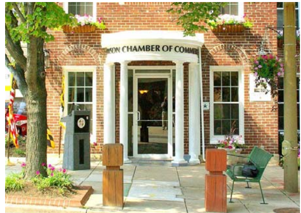
Towson Chamber of Commerce Promotes the Business Environment in Towson