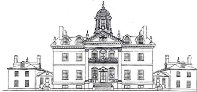
Historic Hampton, Incorporated